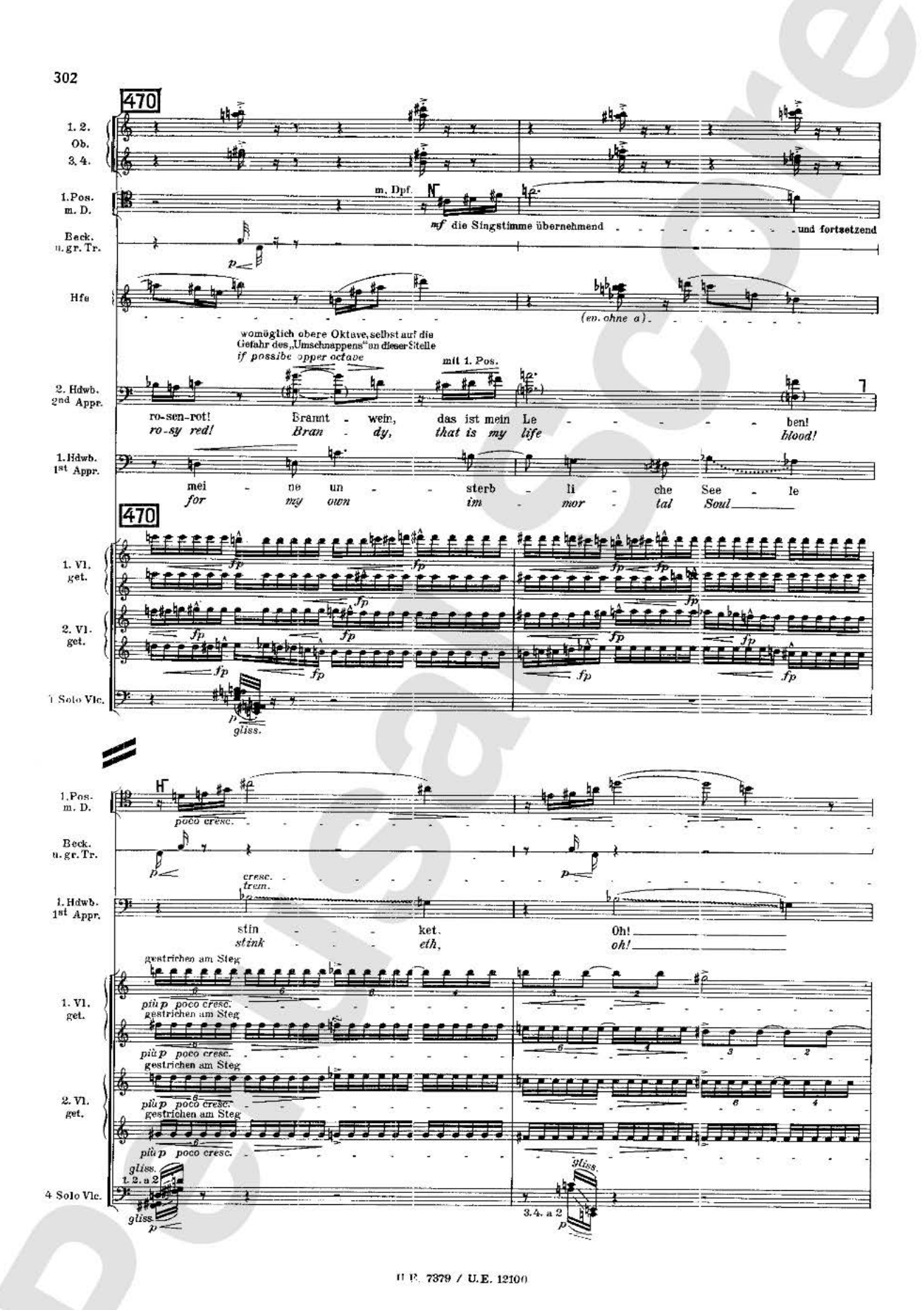
Please note that this material is for perusal purposes only and must not be used for any kind of performance or any other exploitation. Any copying, distribution, dissemination or other use of the material is prohibited.