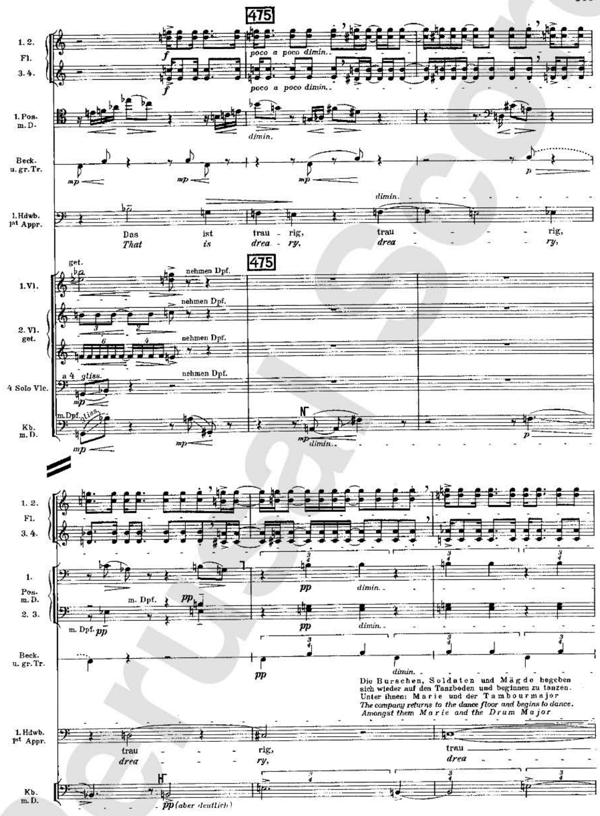
U.E. 7379 / U.E. 12100