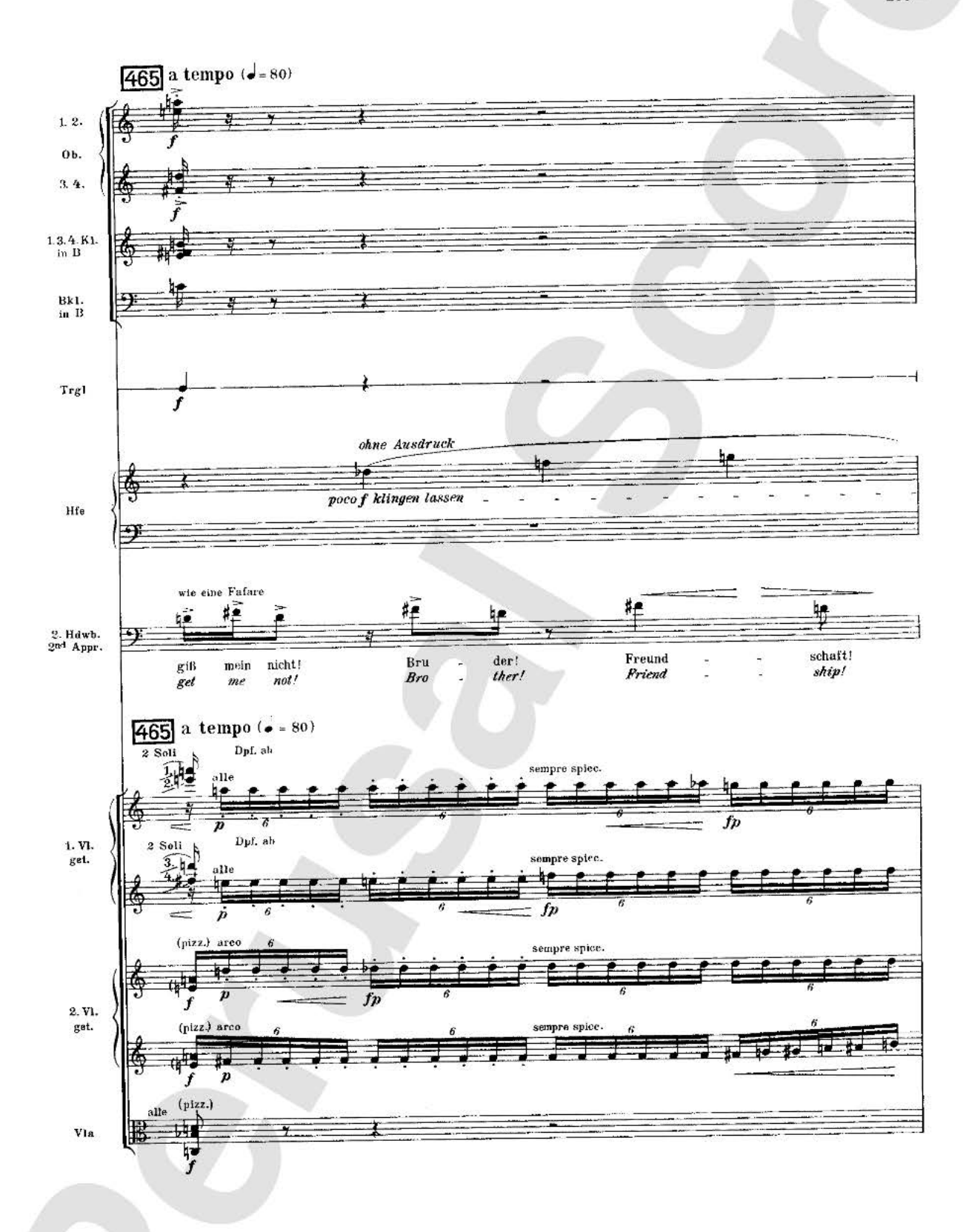
U.E. 7379 / U.E. 12100